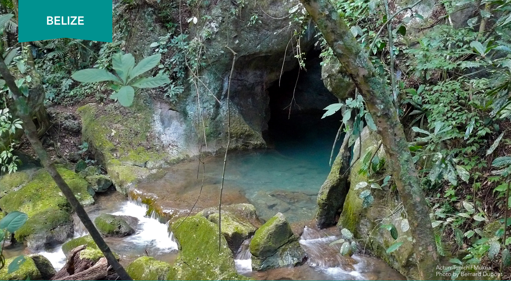
Actun Tunichil Muknal